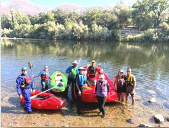
On River Cleanup