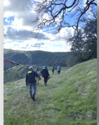
Clearing the trail at Van Noord

It is one of the great joys of my role as Stewardship Manager at ARC to witness the friendships and connections that form when people come together to care for the land. I see this during workdays at Salmon Falls Ranch, when volunteers gather in the cool morning air and hike out with tools to maintain and build trails side by side. I see it when staff and volunteers work together to remove invasive Scotch Broom at our local park or participate in river cleanups. Friendships bloom through monthly water quality monitoring visits, where monitors catch up with each other at their favorite places along