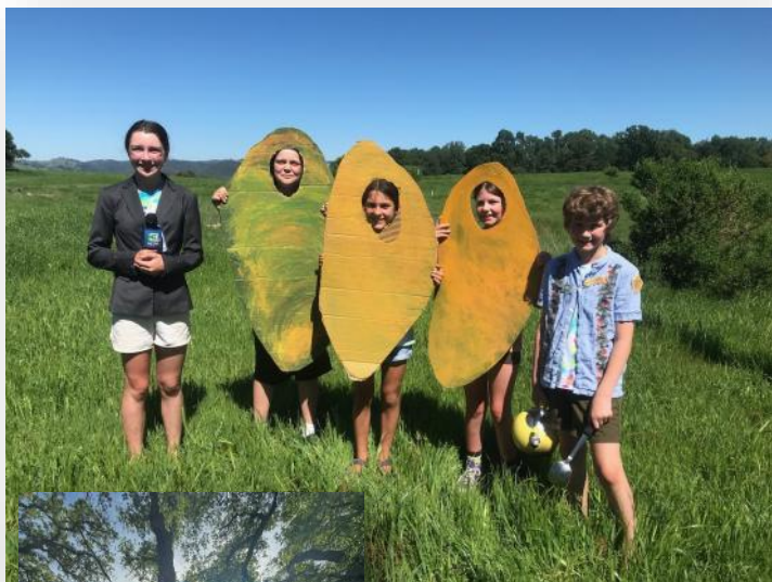
This Nature Bowl team shared the local issue of invasive aquatic hitchhikers in Folsom Lake through a fun and informative skit for their “enviromercial” (environmental commercial) at this year’s Nature Bowl.

Our school programs have had a very full and rich spring season –with field trip activities including macroinvertebrate studies at the pond at Wakamatsu, learning about bat and moth interactions via interactive games, and working together to create a watershed and model its changing water flow throughout the seasons of the year. We have also led Homeschool Fridays with Fog Dog Farm and with our Stewardship Team at Acorn Creek.