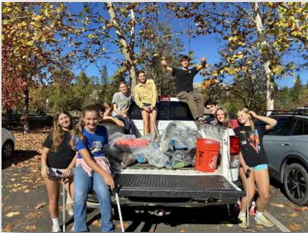
High school friends cleaning up at the river

These shared moments turn stewardship into something more than just tasks. They build community, ground us in what is positive and meaningful, and remind us that caring for the land is also a way of caring for each other. Join us in the fun through the opportunities shared on our stewardship webpage.